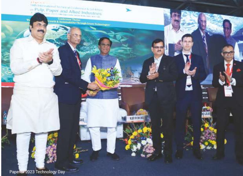
Paperex 2023 Technology Day

Paperex'2025 Conference and Exhibition will offer the latest state-of-the-art technologies and practices for pulp, paper, printing, packaging, tissue, publishing, and other allied industries. Paperex is an ideal platform for sourcing technologically and commercially viable technologies for redefining the future of the paper and paper packaging, tissue and allied industries globally.