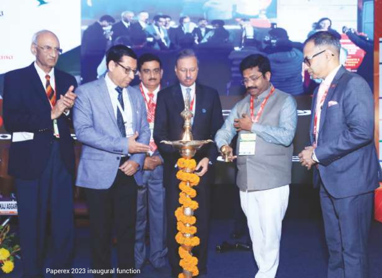
Paperex 2023 inaugural function